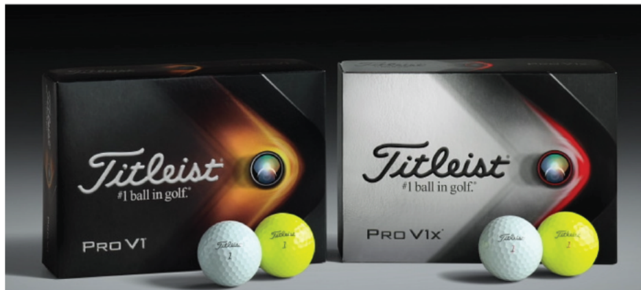
Titleist Golf Balls

What we do: Acushnet operates a series of brands that manufacture golf equipment, clothing, and accessories. These brands include Titleist, FootJoy, Vokey Design, Scotty Cameron, Pinnacle and The KJUS brand.